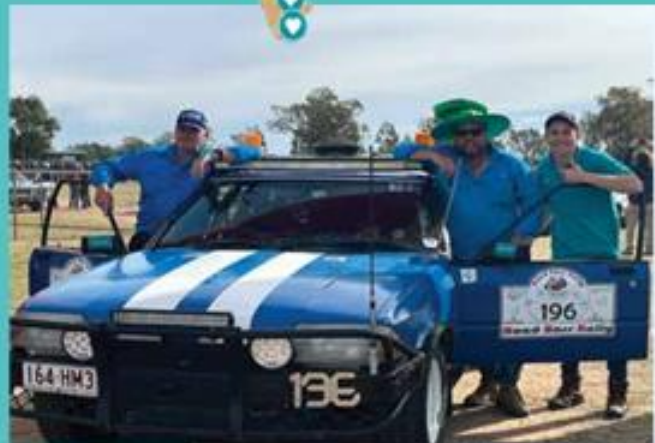
Road Boss Rally

More than 2,000 tonnes of items have been rehomed.